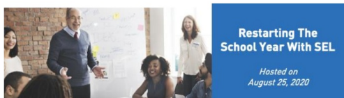
Key Takeaways from the Live Q&A Chat for Educators

You asked, we answered! In response to your questions about Reunite, Renew, and Thrive: SEL Roadmap for Reopening School , we hosted a live Q&A chat with more than 30 education leaders. Download this summary of key takeaways from the event.