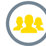
Responsible leaders and productive citizens