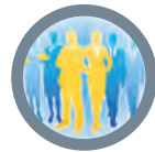
Lead with Character & Ethics

Working on Focus Areas. The action-oriented items in this plan are built around three focus areas and initiatives that represent the work to ensure the strategic priorities become a reality. EPISD is: