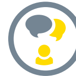
Effective bilingual communicators