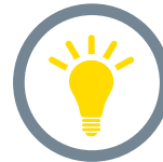
Critical, knowledgeable and creative thinkers