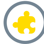
Informed problem solvers