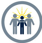
Building Strong Supports