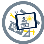
Modernizing Learning Environments