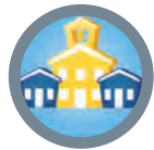
Great Community Schools