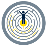
Providing Engaging and Challenging Learning

Working on Focus Areas. The action-oriented items in this plan are built around three focus areas and initiatives that represent the work to ensure the strategic priorities become a reality. EPISD is: